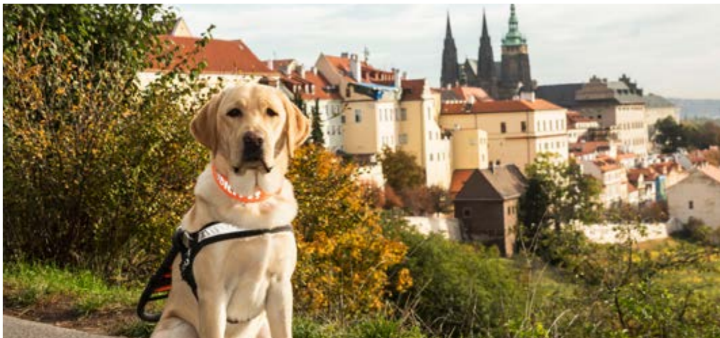
Mathilda Guide Dog, Darwin in Prague