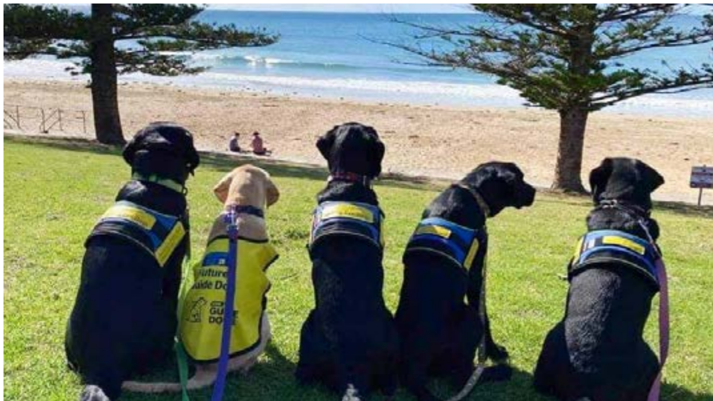
Future CNIB Guide Dog Bridget, a yellow Labrador, at a beach in Geelong, Australia with four Seeing Eye Dog pups, all black Labradors.

In August 2021, the first four puppies from the group that were placed into the care of SED successfully travelled from Melbourne to Toronto where they will continue their training in CNIB's puppy raising program. The remaining six are expected to arrive in Canada before the end of 2021 and will be placed in Calgary, where they will continue their training with the same team member that supported the SED team in Melbourne.